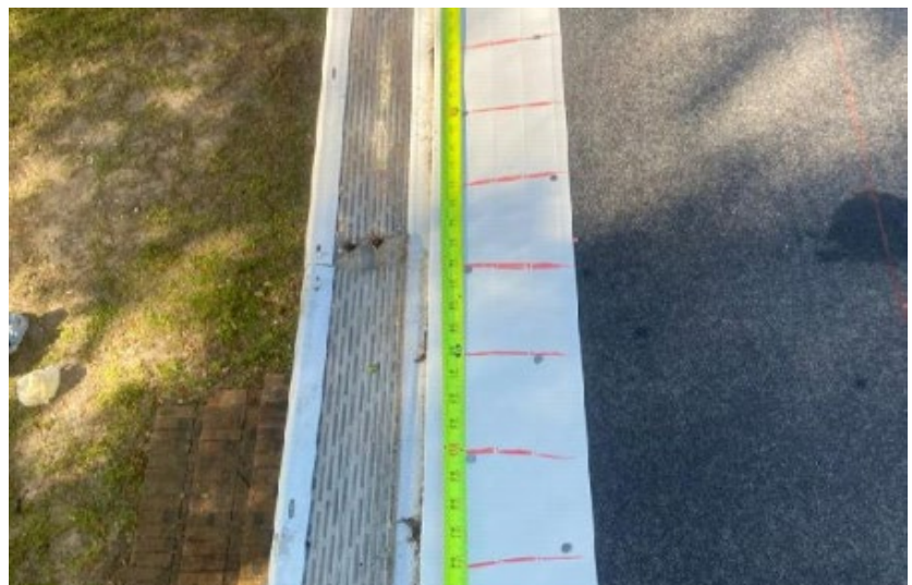
Figure 4. Leaf guard that does not interrupt edge details

For FORTIFIED Roof™ – New Roof compliance, leaf guards may be installed underneath or adjacent to the drip edge so that they do not interrupt FORTIFIED edge details, as shown in Figures 4 and 5.