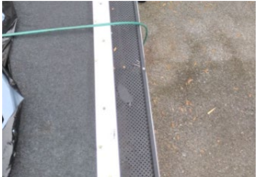
Figure 5. Leaf guard that does not interrupt edge details