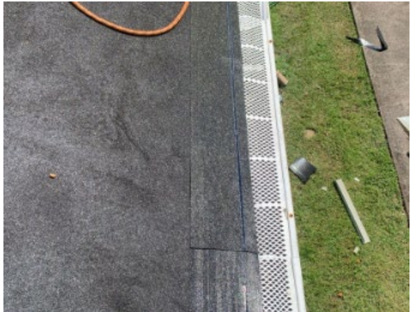
Figure 3. Leaf guards may interrupt FORTIFIED edge details